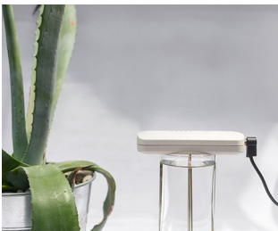
Tool for making colloidal silver solutions