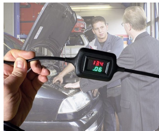
Voltage and current display during trickle charging