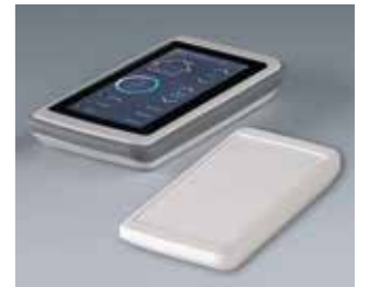
SLIM-CASE Slim modern handheld enclosures (IP 65 optional) for touchscreens up to 4" (10 cm). Optional soft-touch TPE intermediate ring increases height and provides impact and ingress (IP 54) protection.