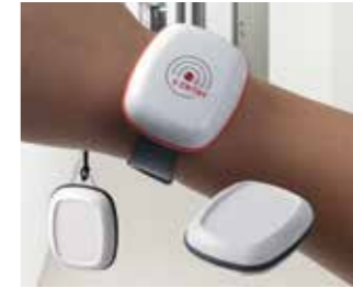
BODY-CASE Comfortable enclosures for personal electronics worn on or close to the body.