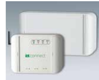
SMART-BOX Tough IP 66 wall-mount and desktop enclosures for industrial electronics. 'Lid closed' installation protects the seal and PCBs in challenging locations.