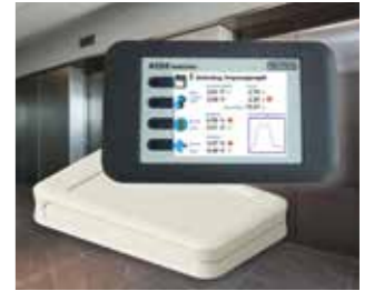
SOFT-CASE Wide-format contoured enclosures for handheld, tabletop or wall-mounted electronics.