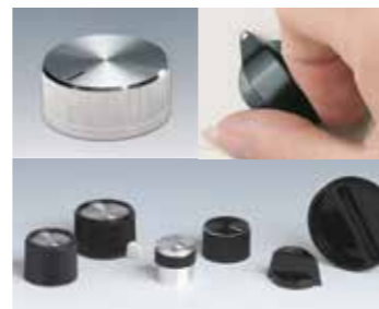
TUNING KNOBS 'CLASSIC'