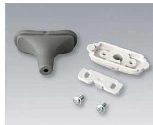
B2911308 Cable gland kit, 3.4 - 4.2 TPE volcano