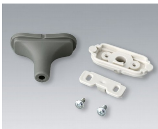
B2911318 Cable gland kit, 4.2 - 5.0 TPE volcano