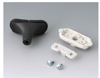
B2911309 Cable gland kit, 3.4 - 4.2 TPE black RAL 9005