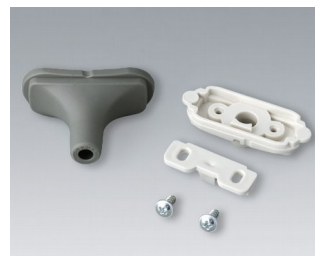
B2911328 Cable gland kit, 5.0 - 5.9 TPE volcano