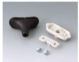
B2911329 Cable gland kit, 5.0 - 5.9 TPE black RAL 9005