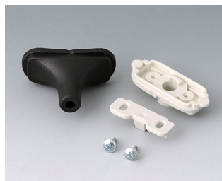
B2911319 Cable gland kit, 4.2 - 5.0 TPE black RAL 9005