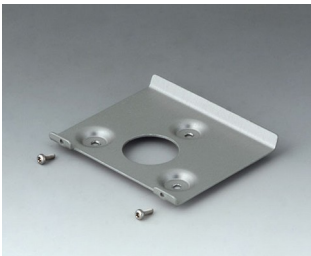
B4514101 Wall suspension element 140 Aluminium