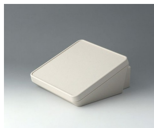
B4418307 PROTEC 180, Vers. III ASA+PC (UL 94 V-0) off-white RAL 9002 180x201x92mm IP 65 opt.