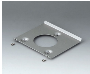
B4518101 Wall suspension element 180 Aluminium