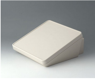
B4422307 PROTEC 220, Vers. III ASA+PC (UL 94 V-0) off-white RAL 9002 220x243x108mm IP 65 opt.