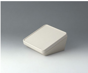
B4414107 PROTEC 140, Vers. I ASA+PC (UL 94 V-0) off-white RAL 9002 140x140x76mm IP 65 opt.