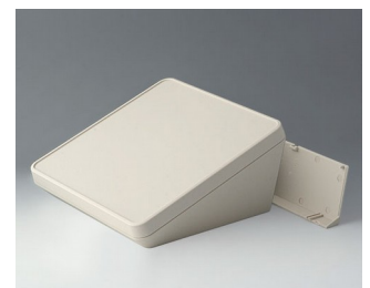
B4422207 PROTEC 220, Vers. II ASA+PC (UL 94 V-0) off-white RAL 9002 220x220x108mm IP 65 opt.