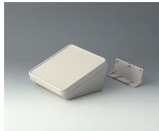
B4414207 PROTEC 140, Vers. II ASA+PC (UL 94 V-0) off-white RAL 9002 140x140x76mm IP 65 opt.