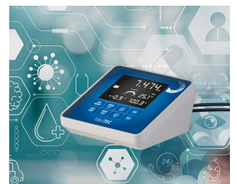
Laboratory measuring device