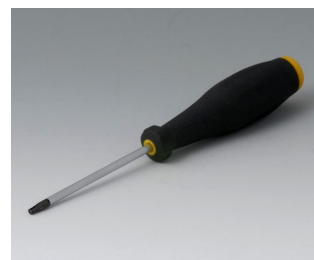
A0399T08 Torx T8 screwdriver