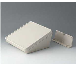
B4418207 PROTEC 180, Vers. II ASA+PC (UL 94 V-0) off-white RAL 9002 180x180x92mm IP 65 opt.