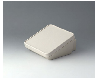
B4414307 PROTEC 140, Vers. III ASA+PC (UL 94 V-0) off-white RAL 9002 140x160x76mm IP 65 opt.