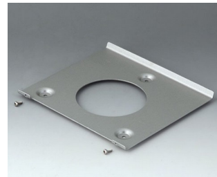
B4522101 Wall suspension element 220 Aluminium