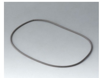
A9504030 Sealing 150