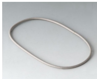
A9502030 Sealing 100