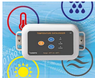
Data logger e.g. for temperature