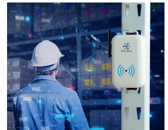
Smart store logistics