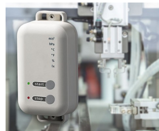
Data logger with gateway function