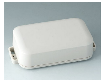
C3208207 EASYTEC 150 ASA+PC (UL 94 V-0) off-white RAL 9002 172x93x46mm IP 65 opt., IP 40