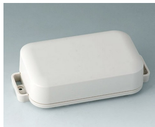
C3207207 EASYTEC 125 ASA+PC (UL 94 V-0) off-white RAL 9002 147x78x37mm IP 65 opt., IP 40