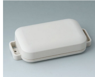
C3206107 EASYTEC 100 ASA+PC (UL 94 V-0) off-white RAL 9002 121x62x26mm IP 65 opt., IP 40