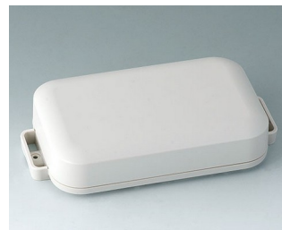
C3208107 EASYTEC 150 ASA+PC (UL 94 V-0) off-white RAL 9002 172x93x36mm IP 65 opt., IP 40