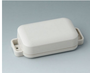
C3204207 EASYTEC 80 ASA+PC (UL 94 V-0) off-white RAL 9002 101x50x26mm IP 65 opt., IP 40