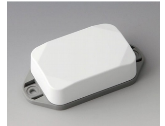
B1822226 MINI-DATA-BOX EF40, high, with flanges ASA+PC (UL 94 V-0) traffic white RAL 9016 60x40x20mm IP 65 opt., IP 40