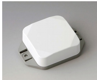
B1804226 MINI-DATA-BOX SF50, high, with flanges ASA+PC (UL 94 V-0) traffic white RAL 9016 50x50x20mm IP 65 opt., IP 40