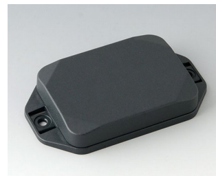
B1824128 MINI-DATA-BOX EF50, flat, with flanges ASA+PC (UL 94 V-0) anthracite grey RAL 7016 70x50x15mm IP 65 opt., IP 40