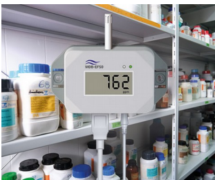
Gas detector for hazardous substances