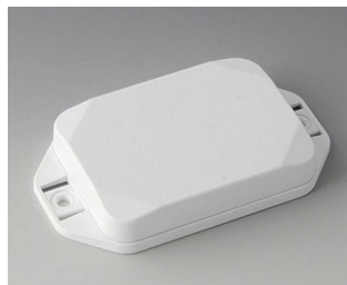
B1824127 MINI-DATA-BOX EF50, flat, with flanges ASA+PC (UL 94 V-0) traffic white RAL 9016 70x50x15mm IP 65 opt., IP 40