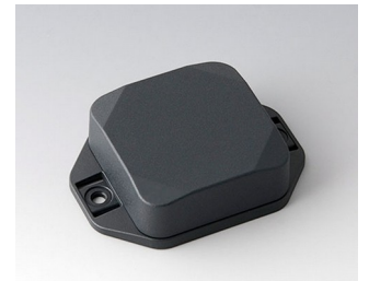
B1804228 MINI-DATA-BOX SF50, high, with flanges ASA+PC (UL 94 V-0) anthracite grey RAL 7016 50x50x20mm IP 65 opt., IP 40