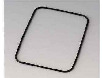
B1924101 Sealing E50/EF50

Subject to technical modification without notice. © by OKW Gehäusesysteme, Buchen/Germany.