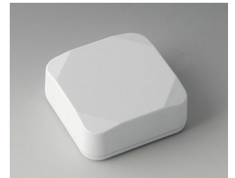
B1804217 MINI-DATA-BOX S50, high ASA+PC (UL 94 V-0) traffic white RAL 9016 50x50x20mm IP 65 opt., IP 40