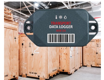
Data logger in transportation