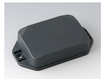
B1824228 MINI-DATA-BOX EF50, high, with flanges ASA+PC (UL 94 V-0) anthracite grey RAL 7016 70x50x20mm IP 65 opt., IP 40