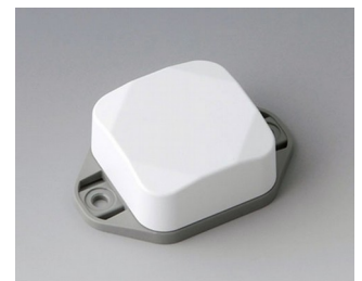
B1802226 MINI-DATA-BOX SF40, high, with flanges ASA+PC (UL 94 V-0) traffic white RAL 9016 40x40x20mm IP 65 opt., IP 40