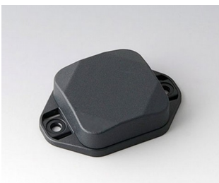
B1802128 MINI-DATA-BOX SF40, flat, with flanges ASA+PC (UL 94 V-0) anthracite grey RAL 7016 40x40x15mm IP 65 opt., IP 40