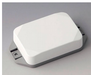
B1824226 MINI-DATA-BOX EF50, high, with flanges ASA+PC (UL 94 V-0) traffic white RAL 9016 70x50x20mm IP 65 opt., IP 40