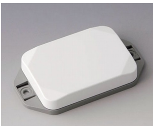
B1824126 MINI-DATA-BOX EF50, flat, with flanges ASA+PC (UL 94 V-0) traffic white RAL 9016 70x50x15mm IP 65 opt., IP 40