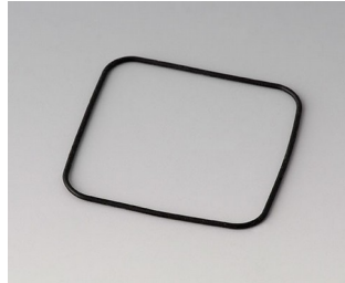
B1904101 Sealing S50/SF50