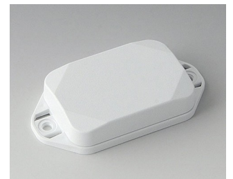
B1822127 MINI-DATA-BOX EF40, flat, with flanges ASA+PC (UL 94 V-0) traffic white RAL 9016 60x40x15mm IP 65 opt., IP 40