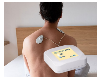
TENS device for pain therapy