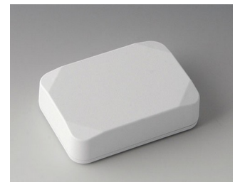
B1824217 MINI-DATA-BOX E50, high ASA+PC (UL 94 V-0) traffic white RAL 9016 70x50x20mm IP 65 opt., IP 40