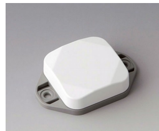
B1802126 MINI-DATA-BOX SF40, flat, with flanges ASA+PC (UL 94 V-0) traffic white RAL 9016 40x40x15mm IP 65 opt., IP 40