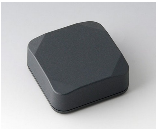
B1804218 MINI-DATA-BOX S50, high ASA+PC (UL 94 V-0) anthracite grey RAL 7016 50x50x20mm IP 65 opt., IP 40