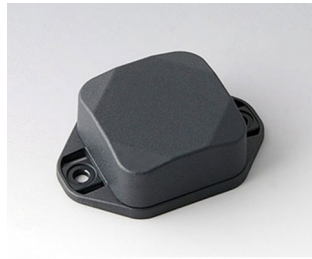
B1802228 MINI-DATA-BOX SF40, high, with flanges ASA+PC (UL 94 V-0) anthracite grey RAL 7016 40x40x20mm IP 65 opt., IP 40