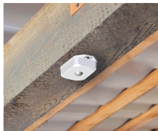
Motion detector with sensor for automatic control