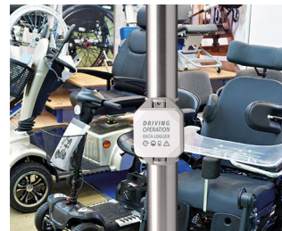
Data logger for Driving Operations