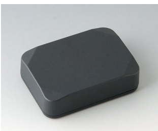
B1824218 MINI-DATA-BOX E50, high ASA+PC (UL 94 V-0) anthracite grey RAL 7016 70x50x20mm IP 65 opt., IP 40