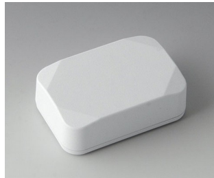
B1822217 MINI-DATA-BOX E40, high ASA+PC (UL 94 V-0) traffic white RAL 9016 60x40x20mm IP 65 opt., IP 40