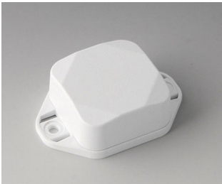
B1802227 MINI-DATA-BOX SF40, high, with flanges ASA+PC (UL 94 V-0) traffic white RAL 9016 40x40x20mm IP 65 opt., IP 40