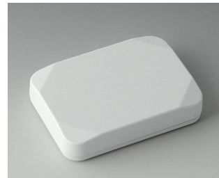
B1824117 MINI-DATA-BOX E50, flat ASA+PC (UL 94 V-0) traffic white RAL 9016 70x50x15mm IP 65 opt., IP 40