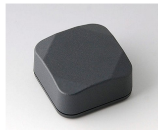
B1802218 MINI-DATA-BOX S40, high ASA+PC (UL 94 V-0) anthracite grey RAL 7016 40x40x20mm IP 65 opt., IP 40