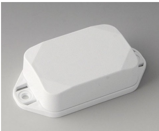
B1822227 MINI-DATA-BOX EF40, high, with flanges ASA+PC (UL 94 V-0) traffic white RAL 9016 60x40x20mm IP 65 opt., IP 40