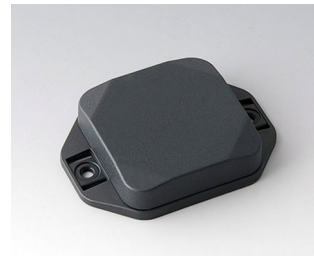
B1804128 MINI-DATA-BOX SF50, flat, with flanges ASA+PC (UL 94 V-0) anthracite grey RAL 7016 50x50x15mm IP 65 opt., IP 40