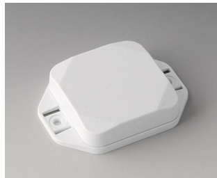
B1804127 MINI-DATA-BOX SF50, flat, with flanges ASA+PC (UL 94 V-0) traffic white RAL 9016 50x50x15mm IP 65 opt., IP 40