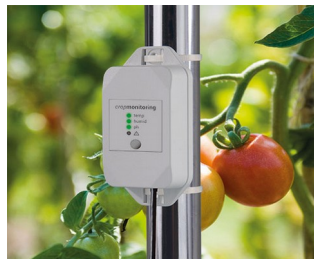
Data logger crop management