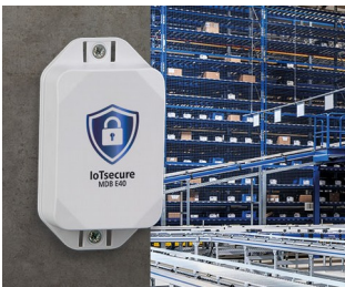
Access authorization of transponders