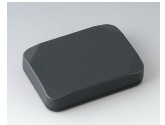
B1824118 MINI-DATA-BOX E50, flat ASA+PC (UL 94 V-0) anthracite grey RAL 7016 70x50x15mm IP 65 opt., IP 40