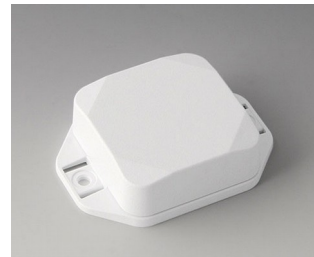
B1804227 MINI-DATA-BOX SF50, high, with flanges ASA+PC (UL 94 V-0) traffic white RAL 9016 50x50x20mm IP 65 opt., IP 40