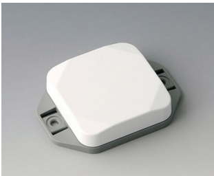
B1804126 MINI-DATA-BOX SF50, flat, with flanges ASA+PC (UL 94 V-0) traffic white RAL 9016 50x50x15mm IP 65 opt., IP 40