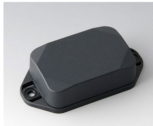
B1822228 MINI-DATA-BOX EF40, high, with flanges ASA+PC (UL 94 V-0) anthracite grey RAL 7016 60x40x20mm IP 65 opt., IP 40