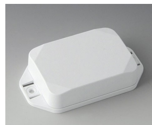
B1824227 MINI-DATA-BOX EF50, high, with flanges ASA+PC (UL 94 V-0) traffic white RAL 9016 70x50x20mm IP 65 opt., IP 40