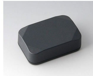
B1822218 MINI-DATA-BOX E40, high ASA+PC (UL 94 V-0) anthracite grey RAL 7016 60x40x20mm IP 65 opt., IP 40