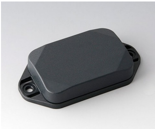
B1822128 MINI-DATA-BOX EF40, flat, with flanges ASA+PC (UL 94 V-0) anthracite grey RAL 7016 60x40x15mm IP 65 opt., IP 40