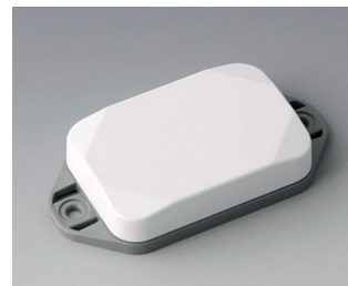
B1822126 MINI-DATA-BOX EF40, flat, with flanges ASA+PC (UL 94 V-0) traffic white RAL 9016 60x40x15mm IP 65 opt., IP 40