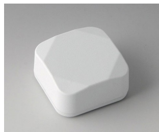
B1802217 MINI-DATA-BOX S40, high ASA+PC (UL 94 V-0) traffic white RAL 9016 40x40x20mm IP 65 opt., IP 40