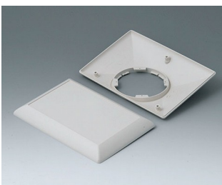
B5017207 Bottom and top part E160 F ABS (UL 94 HB) off-white RAL 9002 160x110x38mm