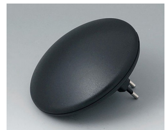
B5011329 ART-CASE R110 H PC+ABS (UL 94 V-0) black RAL 9005 ø110x41mm IP 40