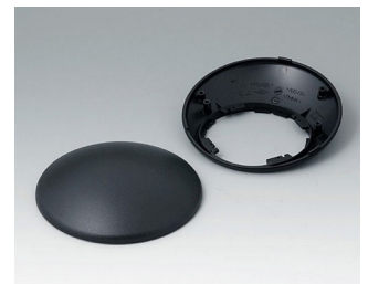
B5010309 Bottom and top part R110 H ABS (UL 94 HB) black RAL 9005 ø110x41mm