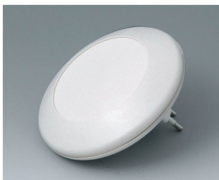
B5011227 ART-CASE R110 F PC+ABS (UL 94 V-0) off-white RAL 9002 ø110x38mm IP 40