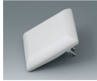
B5013227 ART-CASE S110 F PC+ABS (UL 94 V-0) off-white RAL 9002 110x110x38mm IP 40