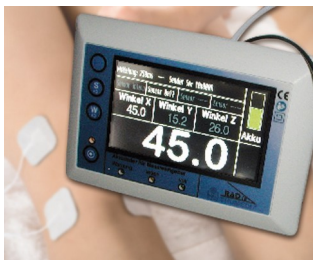
3D angle measurement of articulation systems on a gravity basis