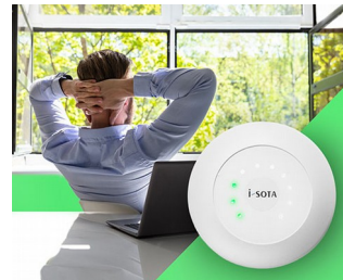
CO2 sensor traffic light