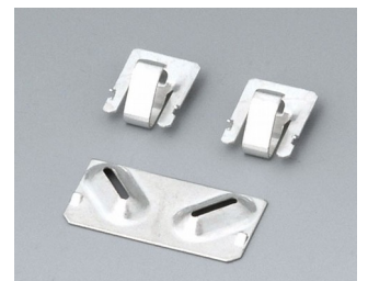
A9190002 Set of battery clips, 2xN/2xAA/2xAAA Steel tin-plated