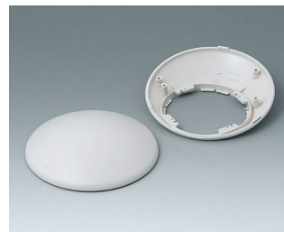
B5010307 Bottom and top part R110 H ABS (UL 94 HB) off-white RAL 9002 ø110x41mm