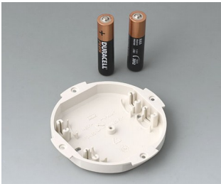
B5111107 Battery compartment, 2 x AAA ABS (UL 94 HB) off-white RAL 9002