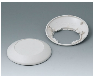
B5010207 Bottom and top part R110 F ABS (UL 94 HB) off-white RAL 9002 ø110x38mm