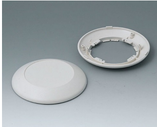
B5010007 Bottom and top part R110 F ABS (UL 94 HB) off-white RAL 9002 ø110x30mm