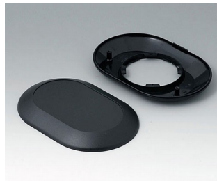
B5015009 Bottom and top part O160 F ABS (UL 94 HB) black RAL 9005 160x110x30mm