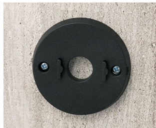
B5111309 Wall mounting set ABS (UL 94 HB) black RAL 9005