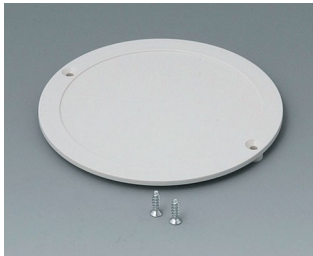
B5011857 Battery compartment lid ABS (UL 94 HB) off-white RAL 9002