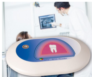
RFID Reader for the CTV system