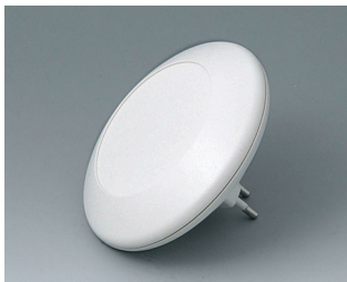
B5011027 ART-CASE R110 F PC+ABS (UL 94 V-0) off-white RAL 9002 ø110x30mm IP 40