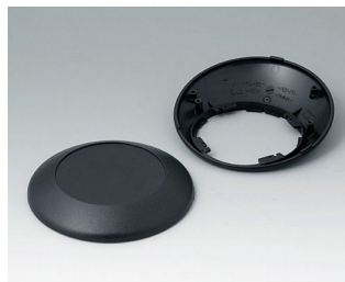
B5010209 Bottom and top part R110 F ABS (UL 94 HB) black RAL 9005 ø110x38mm