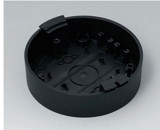
B5011119 Base ABS (UL 94 HB) black RAL 9005