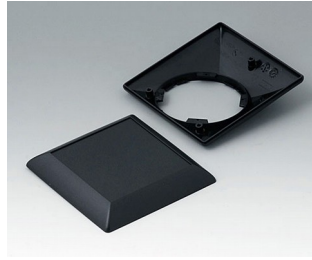
B5012209 Bottom and top part S110 F ABS (UL 94 HB) black RAL 9005 110x110x38mm