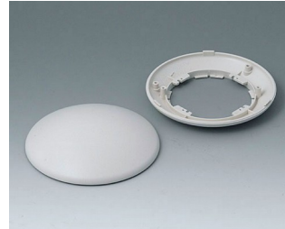
B5010107 Bottom and top part R110 H ABS (UL 94 HB) off-white RAL 9002 ø110x38mm