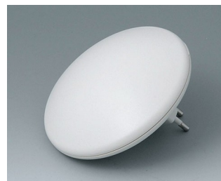
B5011327 ART-CASE R110 H PC+ABS (UL 94 V-0) off-white RAL 9002 ø110x41mm IP 40