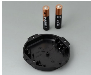
B5111109 Battery compartment, 2 x AAA ABS (UL 94 HB) black RAL 9005