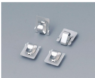
A9166001 Set of battery clips, 2 x AAA Steel tin-plated