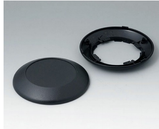
B5010009 Bottom and top part R110 F ABS (UL 94 HB) black RAL 9005 ø110x30mm