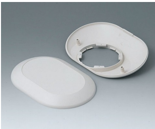
B5015207 Bottom and top part O160 F ABS (UL 94 HB) off-white RAL 9002 160x110x38mm