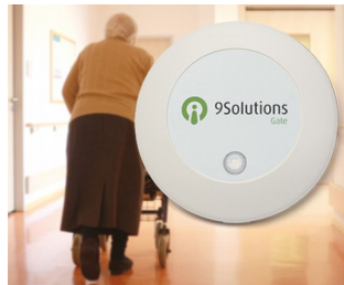
Access management in care facilities