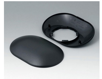
B5015309 Bottom and top part O160 H ABS (UL 94 HB) black RAL 9005 160x110x41mm