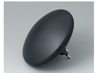
B5011129 ART-CASE R110 H PC+ABS (UL 94 V-0) black RAL 9005 ø110x38mm IP 40