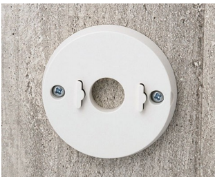
B5111307 Wall mounting set ABS (UL 94 HB) off-white RAL 9002