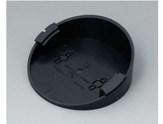
B5011219 Base 30° ABS (UL 94 HB) black RAL 9005