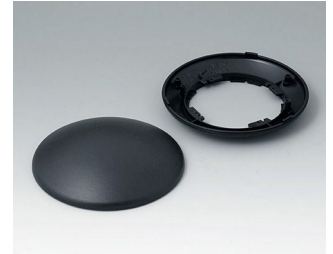
B5010109 Bottom and top part R110 H ABS (UL 94 HB) black RAL 9005 ø110x38mm