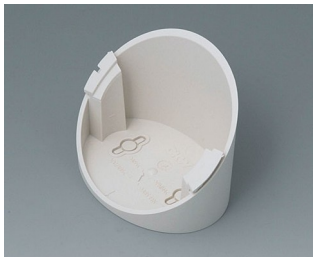
B5011317 Base 55° ABS (UL 94 HB) off-white RAL 9002