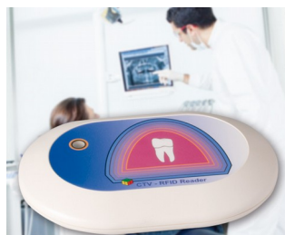
RFID Reader for the CTV system