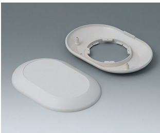
B5015007 Bottom and top part O160 F ABS (UL 94 HB) off-white RAL 9002 160x110x30mm