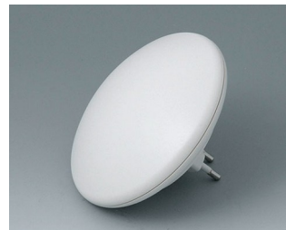
B5011127 ART-CASE R110 H PC+ABS (UL 94 V-0) off-white RAL 9002 ø110x38mm IP 40