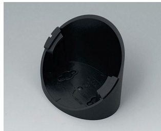
B5011319 Base 55° ABS (UL 94 HB) black RAL 9005