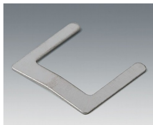
A9166002 Battery contact, 2 x AAA Steel tin-plated