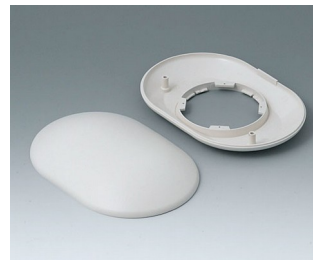
B5015107 Bottom and top part O160 H ABS (UL 94 HB) off-white RAL 9002 160x110x38mm