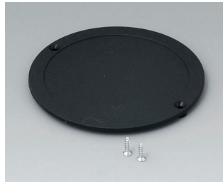
B5011859 Battery compartment lid ABS (UL 94 HB) black RAL 9005