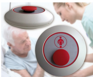
Radio paging mushroom-type button