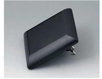
B5013229 ART-CASE S110 F PC+ABS (UL 94 V-0) black RAL 9005 110x110x38mm IP 40