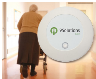
Access management in care facilities