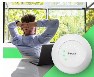
CO2 sensor traffic light