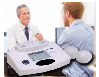
Multiple analytical resonance system