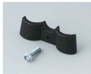
A9166003 Battery holder, 2 x AAA PA 6 (UL 94 HB) black RAL 9005