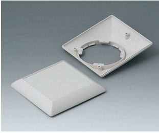
B5012207 Bottom and top part S110F ABS (UL 94 HB) off-white RAL 9002 110x110x38mm