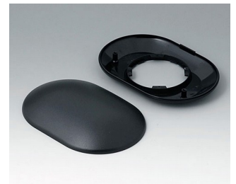
B5015109 Bottom and top part O160 H ABS (UL 94 HB) black RAL 9005 160x110x38mm