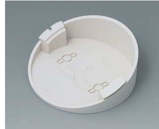
B5011217 Base 30° ABS (UL 94 HB) off-white RAL 9002