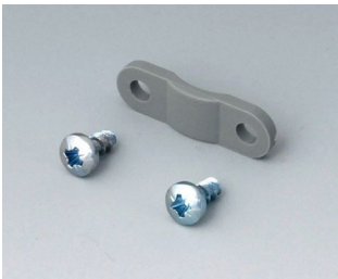
A9199005 Strain relief PA 6 volcano