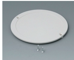
B5011847 Lid ABS (UL 94 HB) off-white RAL 9002