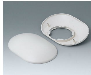
B5015307 Bottom and top part O160 H ABS (UL 94 HB) off-white RAL 9002 160x110x41mm