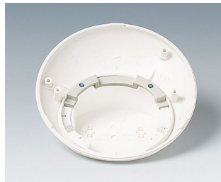
B5111707 Anti-rotation device ABS (UL 94 HB) off-white RAL 9002