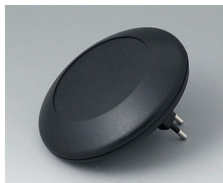
B5011229 ART-CASE R110 F PC+ABS (UL 94 V-0) black RAL 9005 ø110x38mm IP 40