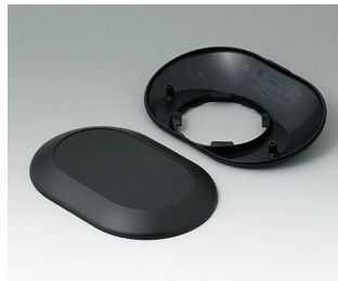
B5015209 Bottom and top part O160 F ABS (UL 94 HB) black RAL 9005 160x110x38mm