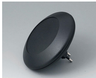
B5011029 ART-CASE R110 F PC+ABS (UL 94 V-0) black RAL 9005 ø110x30mm IP 40