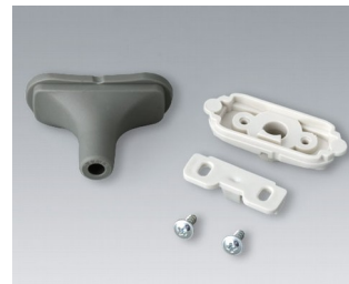
B2911328 Cable gland kit, 5.0 - 5.9 TPE volcano