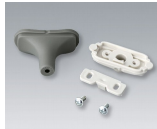
B2911308 Cable gland kit, 3.4 - 4.2 TPE volcano