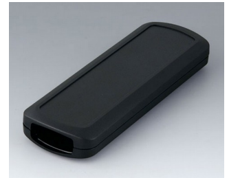
B2834109 CONNECT M ASA+PC (UL 94 V-0) black RAL 9005 156x54x22mm