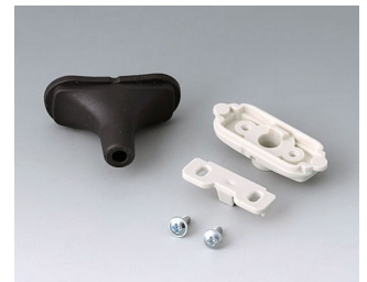
B2911329 Cable gland kit, 5.0 - 5.9 TPE black RAL 9005