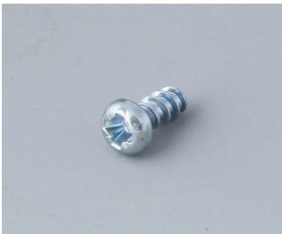
A0304031 Self-tapping screws 2.2 x 5 mm (PZ1)

Subject to technical modification without notice. © by OKW Gehäusesysteme, Buchen/Germany.