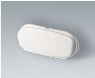
B2811207 End part ASA+PC (UL 94 V-0) off-white RAL 9002