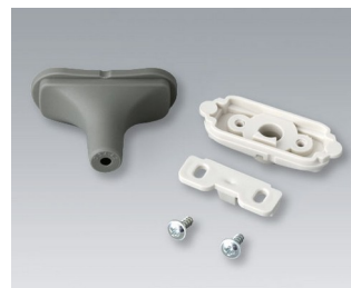
B2911308 Cable gland kit, 3.4 - 4.2 TPE volcano