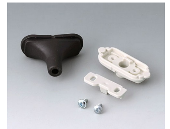
B2911329 Cable gland kit, 5.0 - 5.9 TPE black RAL 9005