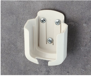
B2931507 Holder M ASA+PC (UL 94 V-0) off-white RAL 9002