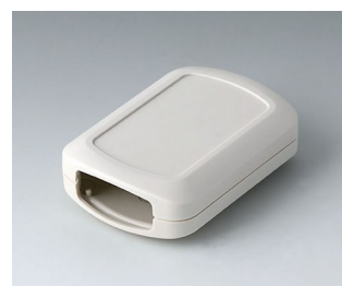
B2832107 CONNECT M ASA+PC (UL 94 V-0) off-white RAL 9002 76x54x22mm