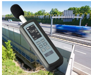
Noise level measurement