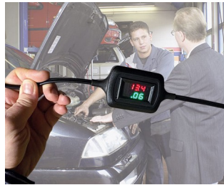
Voltage and current display during trickle charging