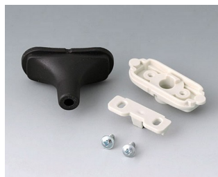
B2911319 Cable gland kit, 4.2 - 5.0 TPE black RAL 9005