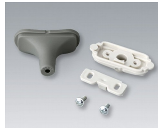
B2911308 Cable gland kit, 3.4 - 4.2 TPE volcano