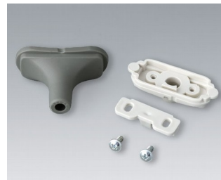
B2911328 Cable gland kit, 5.0 - 5.9 TPE volcano