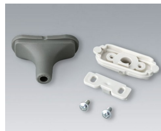
B2911328 Cable gland kit, 5.0 - 5.9 TPE volcano