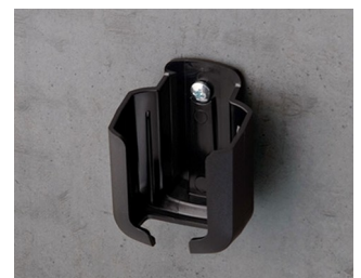
B2921509 Holder S ASA+PC (UL 94 V-0) black RAL 9005