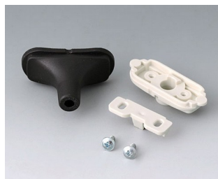
B2911319 Cable gland kit, 4.2 - 5.0 TPE black RAL 9005