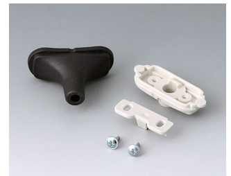
B2911329 Cable gland kit, 5.0 - 5.9 TPE black RAL 9005