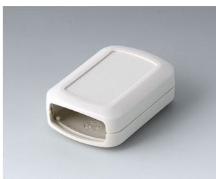
B2822107 CONNECT S ASA+PC (UL 94 V-0) off-white RAL 9002 60x42x22mm