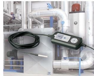
Process monitoring with temperature sensor