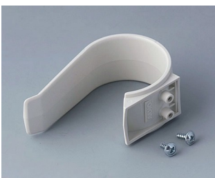
A9167027 Holding clamp PA 6 (UL 94 HB) off-white RAL 9002