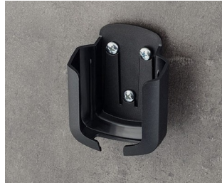
B2931509 Holder M ASA+PC (UL 94 V-0) black RAL 9005