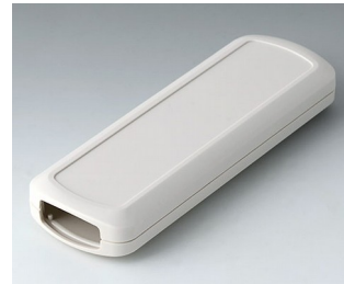
B2834107 CONNECT M ASA+PC (UL 94 V-0) off-white RAL 9002 156x54x22mm