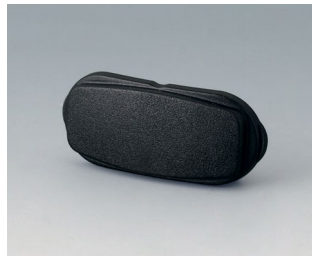
B2811209 End part ASA+PC (UL 94 V-0) black RAL 9005