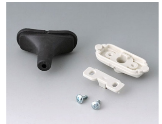
B2911309 Cable gland kit, 3.4 - 4.2 TPE black RAL 9005