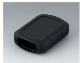
B2832109 CONNECT M ASA+PC (UL 94 V-0) black RAL 9005 76x54x22mm