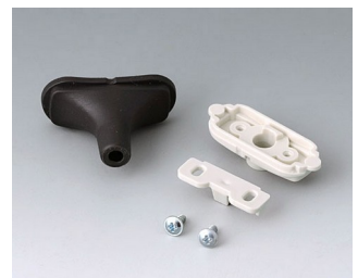
B2911329 Cable gland kit, 5.0 - 5.9 TPE black RAL 9005