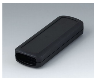
B2824109 CONNECT S ASA+PC (UL 94 V-0) black RAL 9005 120x42x22mm