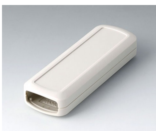
B2824107 CONNECT S ASA+PC (UL 94 V-0) off-white RAL 9002 120x42x22mm