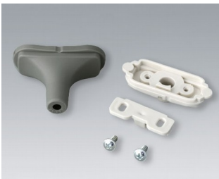
B2911318 Cable gland kit, 4.2 - 5.0 TPE volcano