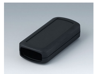
B2823109 CONNECT S ASA+PC (UL 94 V-0) black RAL 9005 90x42x22mm