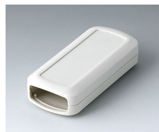
B2823107 CONNECT S ASA+PC (UL 94 V-0) off-white RAL 9002 90x42x22mm