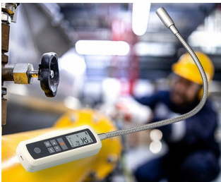
Gas leak detector