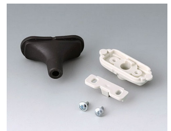
B2911329 Cable gland kit, 5.0 - 5.9 TPE black RAL 9005