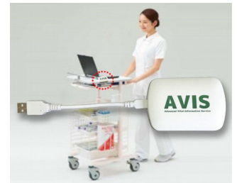
Receiver and data transfer for EMR