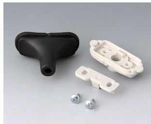
B2911319 Cable gland kit, 4.2 - 5.0 TPE black RAL 9005