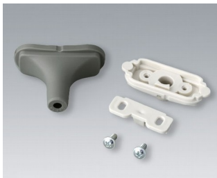
B2911318 Cable gland kit, 4.2 - 5.0 TPE volcano