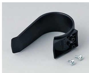
A9167029 Holding clamp PA 6 (UL 94 HB) black RAL 9005