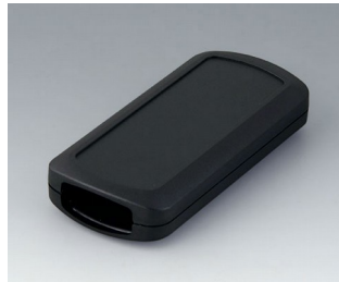
B2833109 CONNECT M ASA+PC (UL 94 V-0) black RAL 9005 116x54x22mm