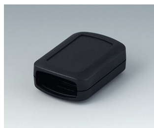
B2822109 CONNECT S ASA+PC (UL 94 V-0) black RAL 9005 60x42x22mm