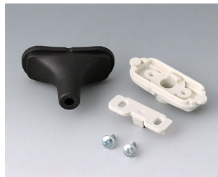
B2911319 Cable gland kit, 4.2 - 5.0 TPE black RAL 9005