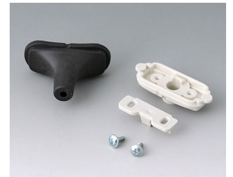
B2911309 Cable gland kit, 3.4 - 4.2 TPE black RAL 9005