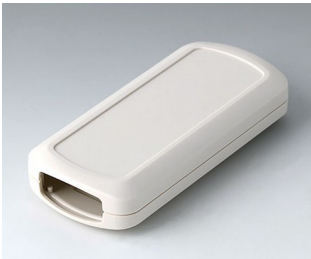
B2833107 CONNECT M ASA+PC (UL 94 V-0) off-white RAL 9002 116x54x22mm