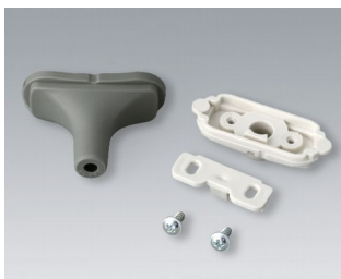
B2911318 Cable gland kit, 4.2 - 5.0 TPE volcano