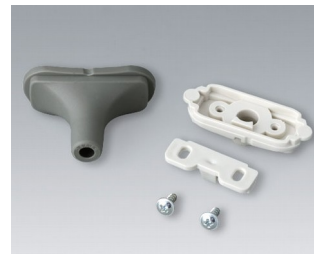
B2911328 Cable gland kit, 5.0 - 5.9 TPE volcano