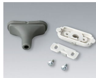
B2911328 Cable gland kit, 5.0 - 5.9 TPE volcano