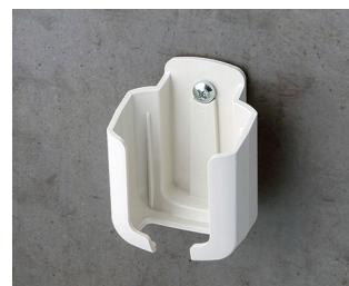
B2921507 Holder S ASA+PC (UL 94 V-0) off-white RAL 9002