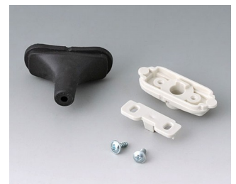
B2911309 Cable gland kit, 3.4 - 4.2 TPE black RAL 9005