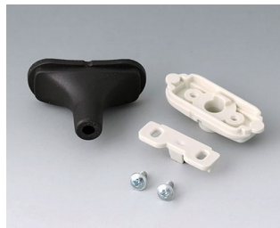
B2911319 Cable gland kit, 4.2 - 5.0 TPE black RAL 9005