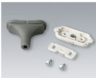
B2911318 Cable gland kit, 4.2 - 5.0 TPE volcano