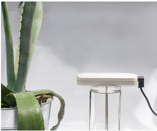
Tool for making colloidal silver solutions