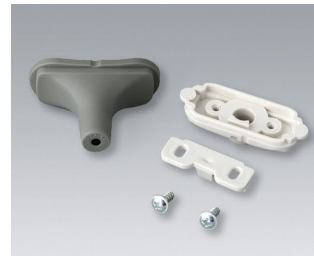
B2911308 Cable gland kit, 3.4 - 4.2 TPE volcano