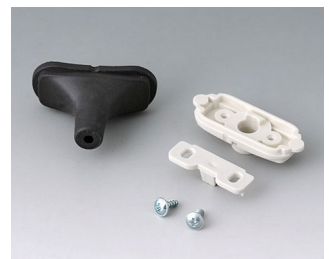
B2911309 Cable gland kit, 3.4 - 4.2 TPE black RAL 9005