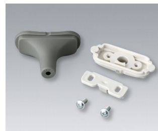
B2911308 Cable gland kit, 3.4 - 4.2 TPE volcano