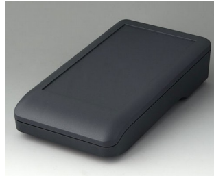
A9007108 DATEC-COMPACT L ASA+PC (UL 94 V-0) lava 206x110x47mm IP 65