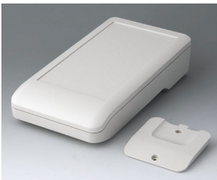
A9007207 DATEC-COMPACT L ASA+PC (UL 94 V-0) off-white RAL 9002 206x110x47mm IP 65