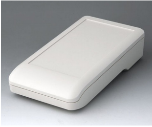
A9007107 DATEC-COMPACT L ASA+PC (UL 94 V-0) off-white RAL 9002 206x110x47mm IP 65