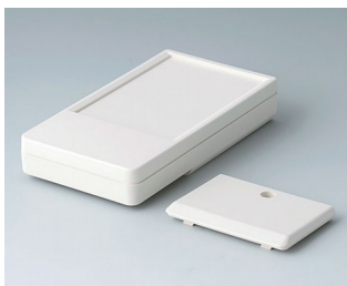
A9072107 DATEC-POCKET-BOX L ABS (UL 94 HB) off-white RAL 9002 120x65x22mm IP 41