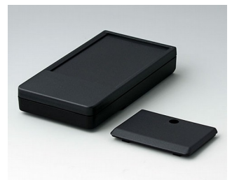
A9072119 DATEC-POCKET-BOX L ABS (UL 94 HB) black RAL 9005 120x65x22mm IP 54