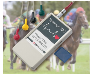
Telemetric ECG system for veterinary medicine