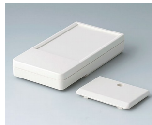
A9072117 DATEC-POCKET-BOX L ABS (UL 94 HB) off-white RAL 9002 120x65x22mm IP 54