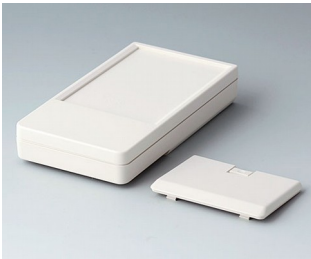
A9072127 DATEC-POCKET-BOX L ABS (UL 94 HB) off-white RAL 9002 120x65x22mm IP 41