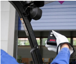
IR remote control for harsh environments