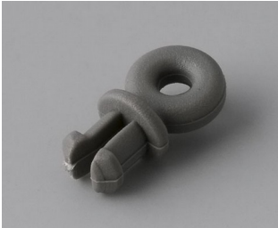
A9100001 Ring eyelet PA 6 volcano