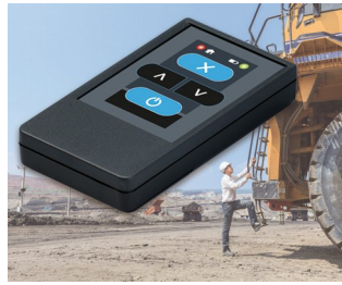
Radio transmitter for machines