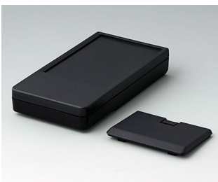
A9072229 DATEC-POCKET-BOX L PMMA (IR) (UL 94 HB) black RAL 9005 120x65x22mm IP 41