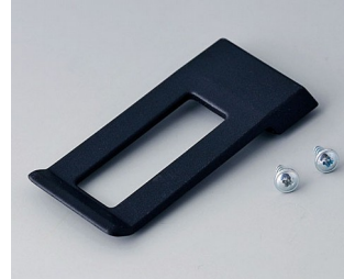
A9172109 Belt/Pocket clip ABS (UL 94 HB) black RAL 9005 62x30mm