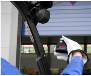
IR remote control for harsh environments