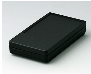
A9070219 DATEC-POCKET-BOX S PMMA (IR) (UL 94 HB) black RAL 9005 85x46x16mm IP 54