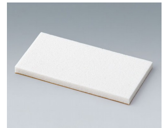
A9250251 Battery spacer PE foam 50x25x3mm