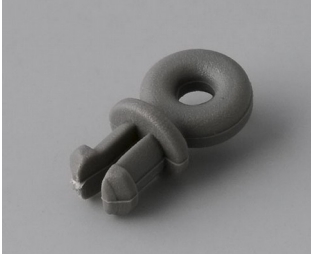
A9100001 Ring eyelet PA 6 volcano