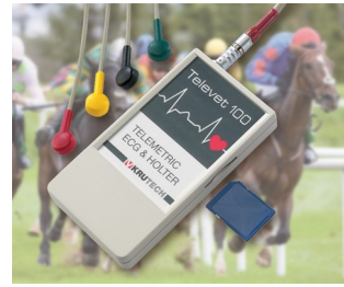
Telemetric ECG system for veterinary medicine