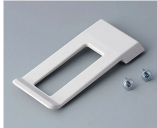
A9172107 Belt/Pocket clip ABS (UL 94 HB) off-white RAL 9002 62x30mm