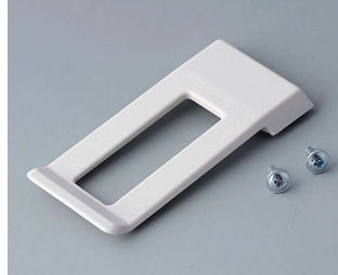
A9172107 Belt/Pocket clip ABS (UL 94 HB) off-white RAL 9002 62x30mm