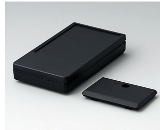
A9071209 DATEC-POCKET-BOX M PMMA (IR) (UL 94 HB) black RAL 9005 105x58x18.5mm IP 41