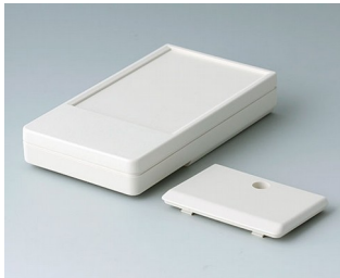
A9071117 DATEC-POCKET-BOX M ABS (UL 94 HB) off-white RAL 9002 105x58x18.5mm IP 54