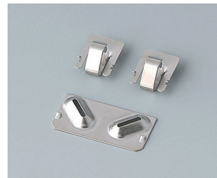
A9190003 Set of battery clips, 2xN/2xAA/2xAAA Steel nickel-plated