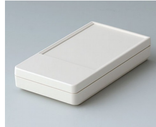
A9070117 DATEC-POCKET-BOX S ABS (UL 94 HB) off-white RAL 9002 85x46x16mm IP 54