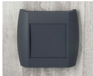
A9092108 DIATEC XS ABS (UL 94 HB) lava 150x37x155mm IP 40