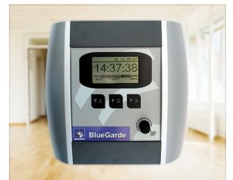
House control unit