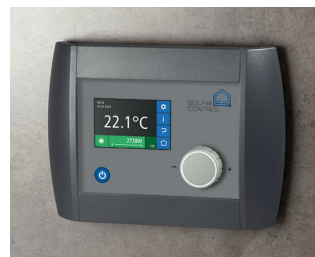
Solar Control Panel