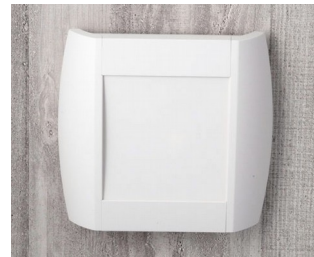
A9093107 DIATEC S ABS (UL 94 HB) off-white RAL 9002 210x48x200mm IP 40