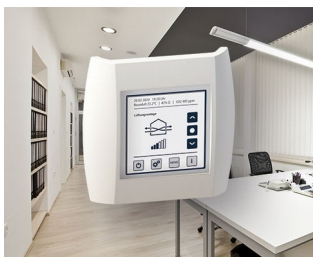
Indoor air quality control