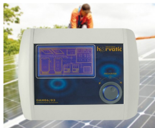
Control unit for photovoltaic solar installations