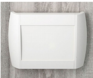
A9094107 DIATEC M ABS (UL 94 HB) off-white RAL 9002 270x48x200mm IP 40