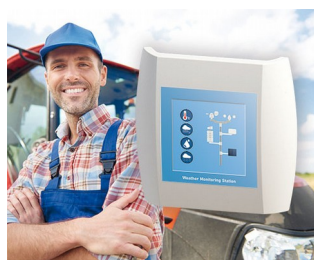
Weather Monitoring Station