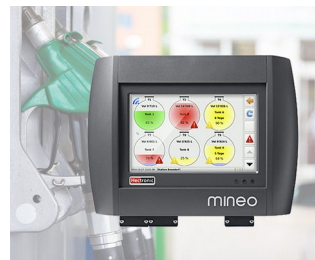
Controller for intelligent tank management