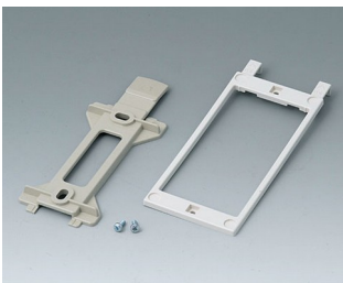
B1360048 Wall suspension elements ABS (UL 94 HB) pebble grey RAL 7032