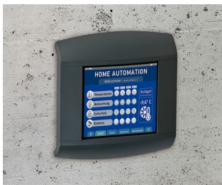
Control panel for home automation