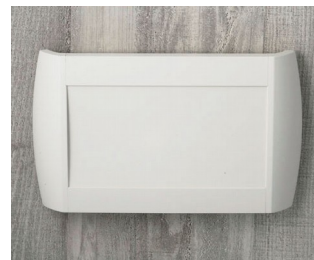
A9095107 DIATEC L ABS (UL 94 HB) off-white RAL 9002 330x48x200mm IP 40