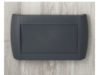
A9095108 DIATEC L ABS (UL 94 HB) lava 330x48x200mm IP 40