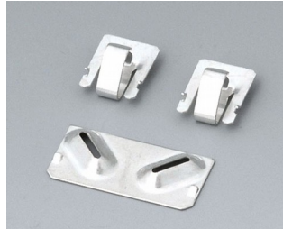
A9190002 Set of battery clips, 2xN/2xAA/2xAAA Steel tin-plated