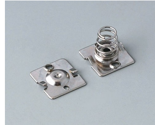
A9190015 Set of battery clips, 2 x AA Steel nickel-plated