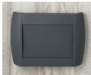
A9094108 DIATEC M ABS (UL 94 HB) lava 270x48x200mm IP 40