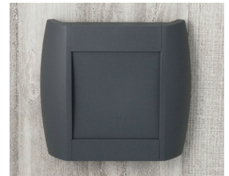
A9093108 DIATEC S ABS (UL 94 HB) lava 210x48x200mm IP 40