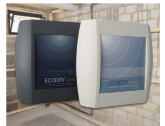
Systems for drying brickwork