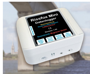
Miniature data logger for crack displacements and climatic data