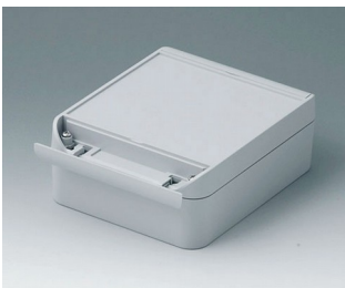
C6013161 SMART-BOX WIDTH 130 ASA+PC (UL 94 V-0) light grey RAL 7035 160x130x60mm IP 66