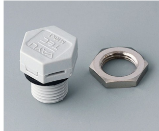
C2310917 Pressure equalisation element M10x1 PA 6 (UL 94 HB) light grey RAL 7035 IP 56