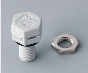
C2306917 Pressure equalisation element M6x0.75 PA 6 (UL 94 HB) light grey RAL 7035 IP 56