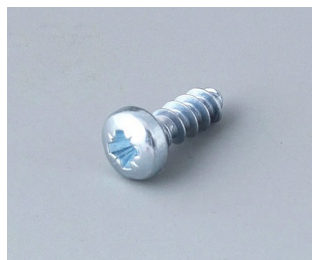
A0308031 Self-tapping screws 3 x 8 mm (PZ1)