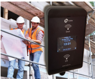
RFID card reader for construction site workers