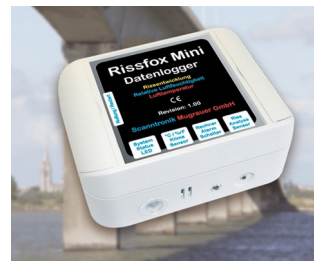
Miniature data logger for crack displacements and climatic data