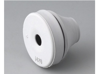
C2320137 Cable grommet EPDM light grey RAL 7035 IP 67