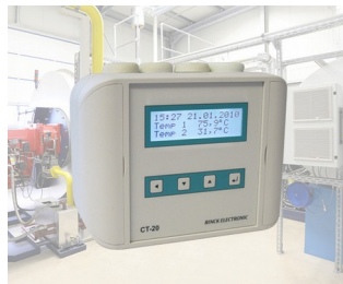
Universal temperature controller / Temperature difference controller