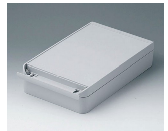
C6017281 SMART-BOX WIDTH 170 ASA+PC (UL 94 V-0) light grey RAL 7035 280x170x60mm IP 65