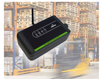
Pedestrian Alert System