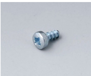
A0306031 Self-tapping screws 3 x 6 mm (PZ1)