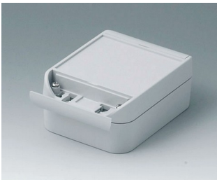
C6009121 SMART-BOX WIDTH 90 ASA+PC (UL 94 V-0) light grey RAL 7035 120x90x50mm IP 66