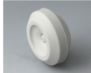
C2316147 Cable grommet TPE light grey RAL 7035 IP 67