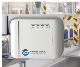
Data logger for machine monitoring