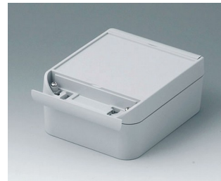
C6011141 SMART-BOX WIDTH 110 ASA+PC (UL 94 V-0) light grey RAL 7035 140x110x60mm IP 66