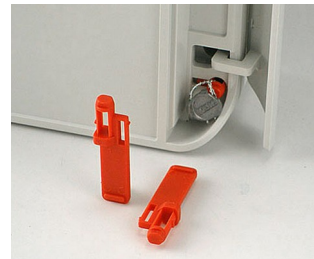
C6100016 Set of security PA 6 red