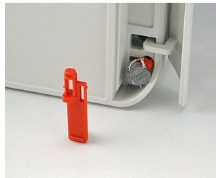
C6100006 Security plug PA 6 red