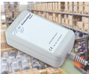
Active UHF RFID system