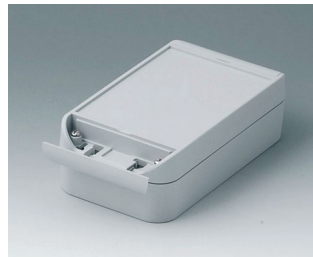
C6009161 SMART-BOX WIDTH 90 ASA+PC (UL 94 V-0) light grey RAL 7035 160x90x50mm IP 66