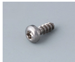
A0308132 Self-tapping screw 3 x 8 mm (T10) Stainless steel