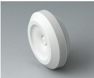
C2320147 Cable grommet TPE light grey RAL 7035 IP 67