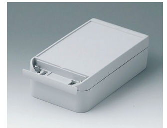
C6011201 SMART-BOX WIDTH 110 ASA+PC (UL 94 V-0) light grey RAL 7035 200x110x60mm IP 66