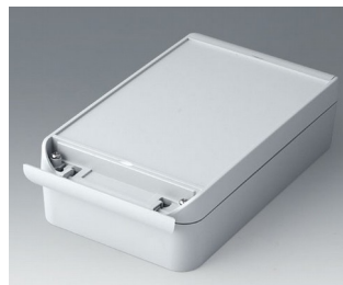
C6013221 SMART-BOX WIDTH 130 ASA+PC (UL 94 V-0) light grey RAL 7035 220x130x60mm IP 66