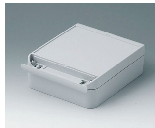
C6015181 SMART-BOX WIDTH 150 ASA+PC (UL 94 V-0) light grey RAL 7035 180x150x60mm IP 66