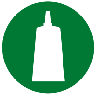
Installation / Assembly of accessories