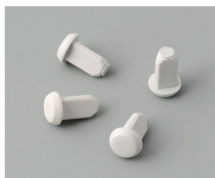
C2299018 Case feet TPE (UL 94 HB)