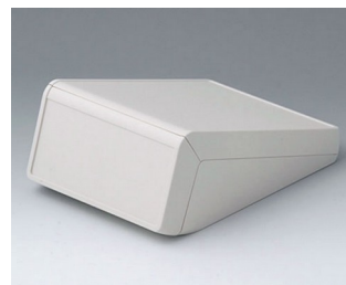
B4056127 UNITEC M, 1.4/0.6 ABS (UL 94 HB) off-white RAL 9002 148x210x80mm IP 40