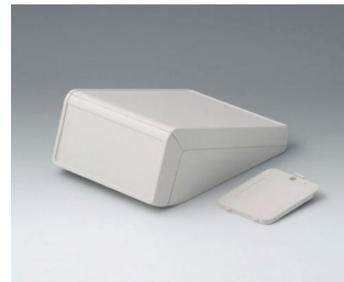
B4054227 UNITEC S, 1.4/0.6 ABS (UL 94 HB) off-white RAL 9002 125x177x69mm IP 40