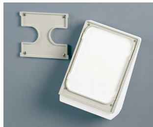
B4156307 Wall suspension element M off-white RAL 9002