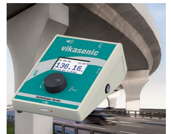
Ultrasonic measuring device