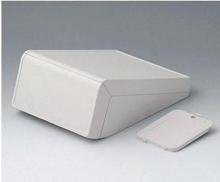
B4056207 UNITEC M, 0.6/0.6 ABS (UL 94 HB) off-white RAL 9002 148x210x80mm IP 40