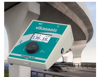
Ultrasonic measuring device