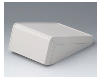
B4056137 UNITEC M, 0.6/1.4 ABS (UL 94 HB) off-white RAL 9002 148x210x80mm IP 40