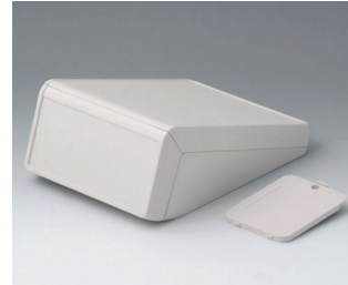
B4056227 UNITEC M, 1.4/0.6 ABS (UL 94 HB) off-white RAL 9002 148x210x80mm IP 40