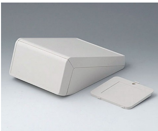
B4056307 UNITEC M, 0.6/0.6 ABS (UL 94 HB) off-white RAL 9002 148x210x80mm IP 40