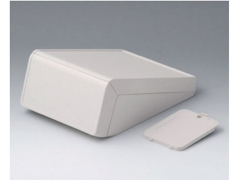
B4056237 UNITEC M, 0.6/1.4 ABS (UL 94 HB) off-white RAL 9002 148x210x80mm IP 40