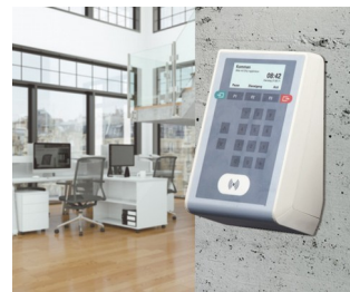
Time recording terminal