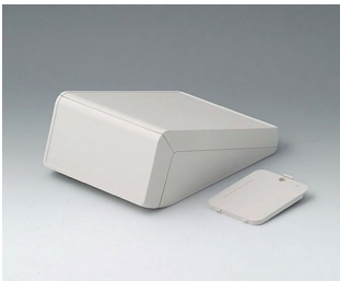
B4054207 UNITEC S, 0.6/0.6 ABS (UL 94 HB) off-white RAL 9002 125x177x69mm IP 40