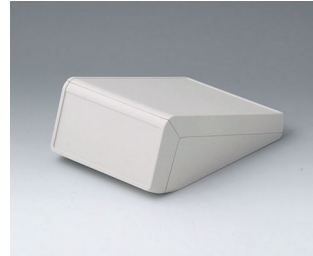
B4054127 UNITEC S, 1.4/0.6 ABS (UL 94 HB) off-white RAL 9002 125x177x69mm IP 40