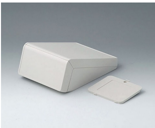
B4054307 UNITEC S, 0.6/0.6 ABS (UL 94 HB) off-white RAL 9002 125x177x69mm IP 40