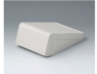
B4054137 UNITEC S, 0.6/1.4 ABS (UL 94 HB) off-white RAL 9002 125x177x69mm IP 40