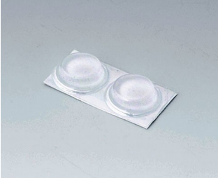
A9212330 Anti-slide feet 12 x 3.5 mm transparent

Subject to technical modification without notice. © by OKW Gehäusesysteme, Buchen/Germany.