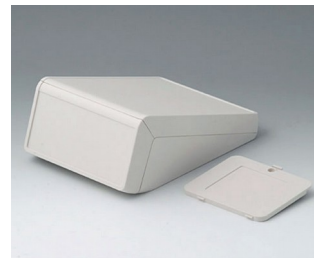
B4056327 UNITEC M, 1.4/0.6 ABS (UL 94 HB) off-white RAL 9002 148x210x80mm IP 40