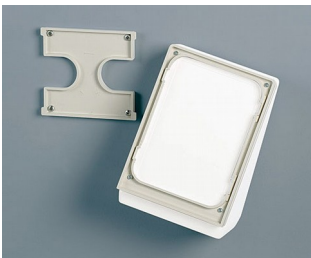
B4154307 Wall suspension element S off-white RAL 9002