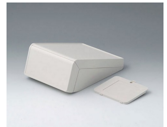
B4054337 UNITEC S, 0.6/1.4 ABS (UL 94 HB) off-white RAL 9002 125x177x69mm IP 40