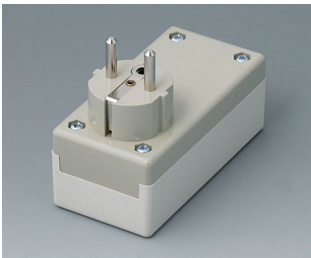
A9011665 PLUG CASE F / D, Vers. I PC+ABS (UL 94 V-0) off-white RAL 9002 100x50x40mm