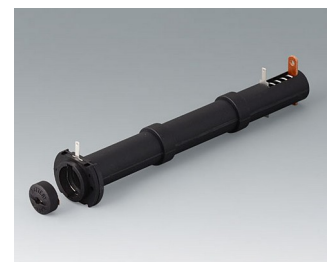
A9301330 Battery holder, 3 x AA PA black RAL 9005