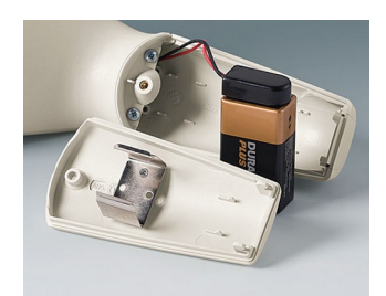
A9156003 Battery holder, 1 x 9 V (PP3) Steel nickel-plated