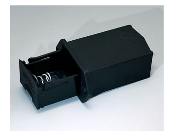
A9302510 Battery holder, 1 x 9 V (PP3) PA black RAL 9005