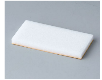
A9250250 Battery spacer PE foam