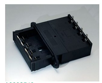
A9302540 Battery holder, 4 x AA PA black RAL 9005