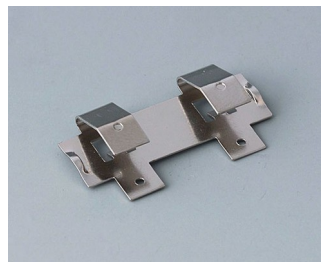
A9193005 Battery clips, double contact Steel nickel-plated