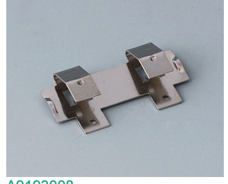
A9193008 Battery clips, double contact CuBe nickel-plated