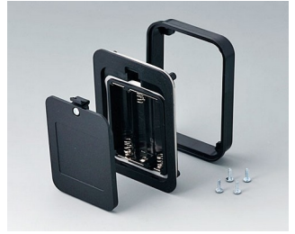
A9336119 Battery compartment kit, 3 x AA ABS (UL 94 HB) black RAL 9005 93x69mm IP 54