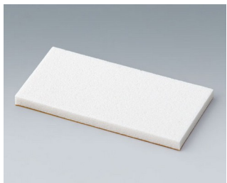
A9250251 Battery spacer PE foam