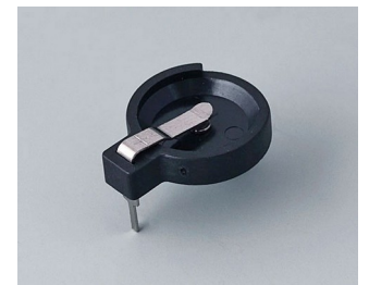
A9193039 Button cell holder, Ø 12 mm