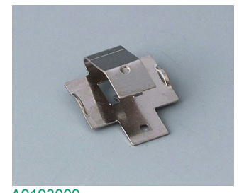
A9193009 Battery clips, single contact CuBe nickel-plated

Subject to technical modification without notice. @ by OKW Gehäusesysteme, Buchen/Germany.