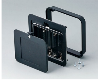
A9338119 Battery compartment kit, 5 x AA ABS (UL 94 HB) black RAL 9005 93x98mm IP 54