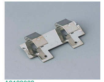
A9193003 Battery-clips, double contact Steel tin-plated