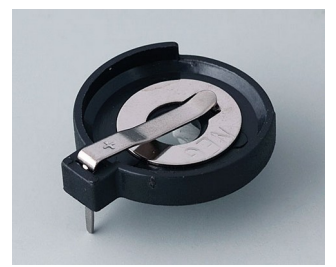
A9193038 Button cell holder, Ø 23 mm