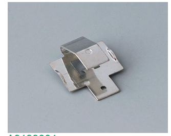
A9193004 Battery-clips, single contact Steel tin-plated