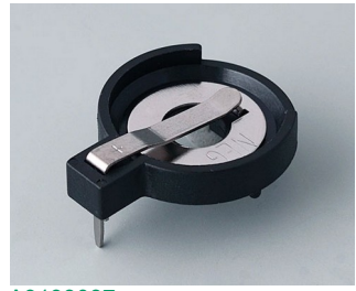
A9193037 Button cell holder, Ø 20 mm