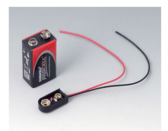
A9156002 Plug-in contact, 1 x 9 V (PP3)