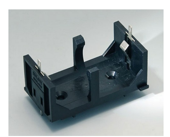
A9303210 Battery holder, 1 x C PA black RAL 9005