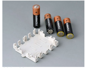
A9174004 Battery compartment, 4 x AA ABS (UL 94 HB) off-white RAL 9002