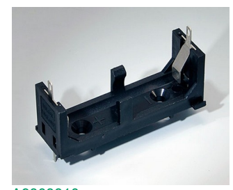
A9303310 Battery holder, 1 x AA PA black RAL 9005