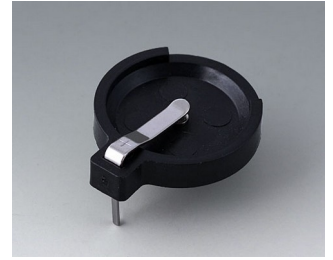
A9193040 Button cell holder, Ø 16 mm