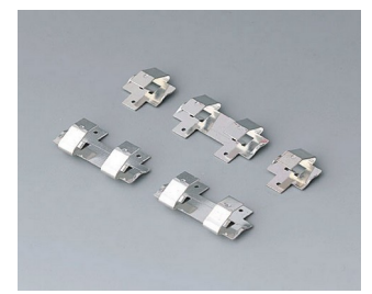
A9161001 Set of battery clips, 4 x AA Steel tin-plated