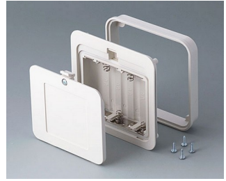
A9338117 Battery compartment kit, 5 x AA ABS (UL 94 HB) off-white RAL 9002 93x98mm IP 54