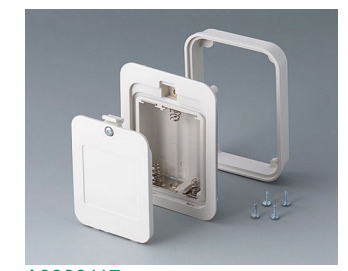
A9336117 Battery compartment kit, 3 x AA ABS (UL 94 HB) off-white RAL 9002 93x69mm IP 54