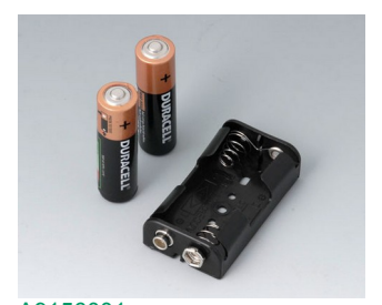
A9156001 Battery holder, 2 x AA PP black RAL 9005