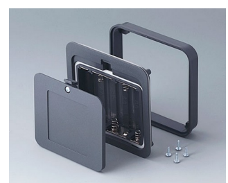
A9338218 Battery compartment kit, 5 x AA ASA+PC (UL 94 V-0) lava 93x98mm IP 54