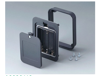
A9336118 Battery compartment kit, 3 x AA ABS (UL 94 HB) lava 93x69mm IP 54