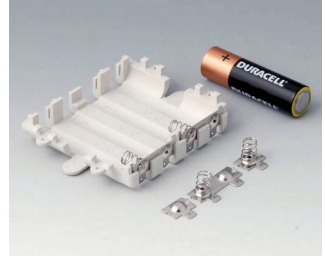
A9345217 Set of battery compartment, 4 x AA ABS (UL 94 HB) off-white RAL 9002