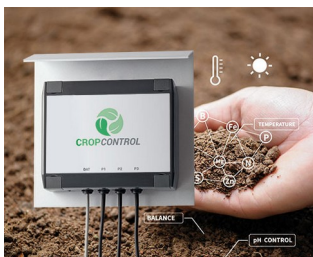
Smart Farming - system for long-term measurements