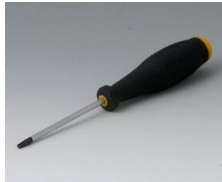
A0399T10 Torx T10 screwdriver