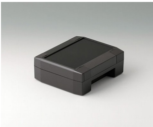
C8011131 SOLID-BOX 115 PC+ABS (UL 94 V-0) anthracite grey RAL 7016 135x115x50mm IP 66, IP 67, IK 08