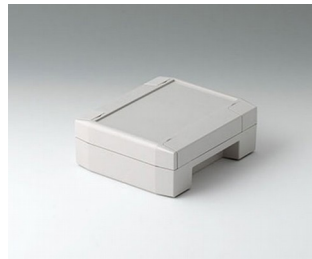
C8011132 SOLID-BOX 115 PC+ABS (UL 94 V-0) light grey RAL 7035 135x115x50mm IP 66, IP 67, IK 08