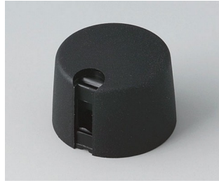
A1024649 TOP-KNOBS 24 PA 6 nero 24x16mm