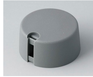
A1031048 TOP-KNOBS 31 PA 6 volcano 31x16mm 4mm