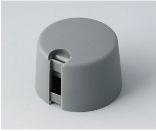
A1024648 TOP-KNOBS 24 PA 6 volcano 24x16mm